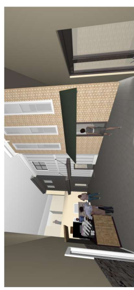
GALLERY FACING REAR