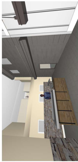
GALLERY FACING RIGHT REAR