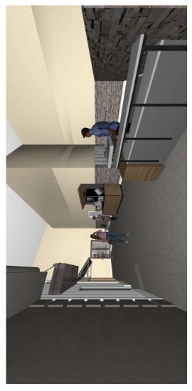
GALLERY FACING FRONT