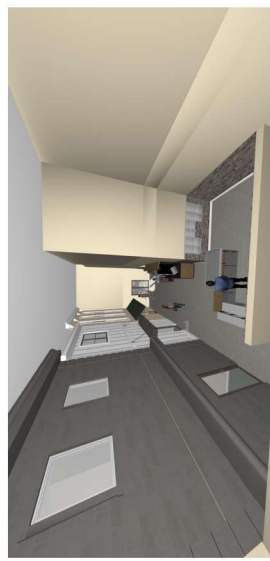
GALLERY FROM MEZZANINE

© COPYRIGHT ARCHITECTURAL CONCEPT DESIGN GROUP, LLC ALL RIGHTS RESERVED. NO PART OF THIS DOCUMENT OR THE CONTENTS HEREIN MAY BE REPRODUCED OR TRANSMITTED IN ANY FORM OR BY ANY MEANS, ELECTRONIC OR MECHANICAL, INCLUDING PHOTOCOPYING, RECORDING, OR BY ANY INFORMATION STORAGE AND RETRIEVAL SYSTEM, WITHOUT THE WRITTEN PERMISSION OF ARCHITECTURAL CONCEPT DESIGN GROUP, LLC.