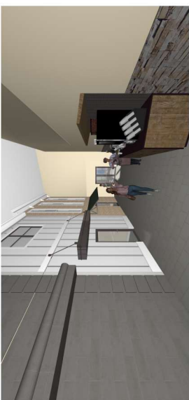
GALLERY FACING FRONT