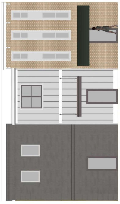
GALLERY RIGHT ELEVATION