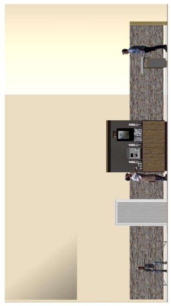
GALLERY LEFT ELEVATION