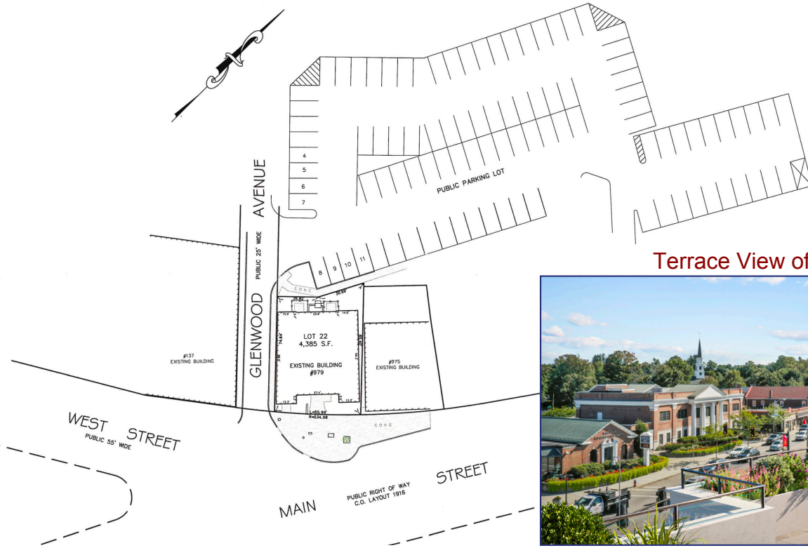
Terrace View of Walpole Center

979 MAIN STREET WALPOLE, MASSACHUSETTS 02081