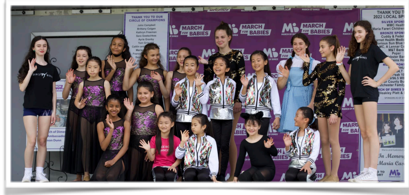
Dance Works Senior and Junior Company Performing Group dancers presented at the March for Babies outdoor event at FDR State Park on May 15th.