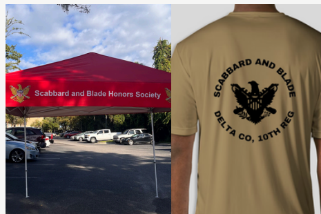
Thanks to our fundraising success, we invested in new gear for our members. We acquired a personalized EZ-UP tent for event use and 120 Dri-Fit shirts to be distributed to members!