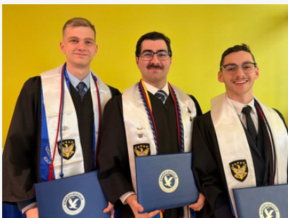
Three of our members graduated this semester. They were the first class to be recognized in the commencement packet under ERAU Honor Societies!