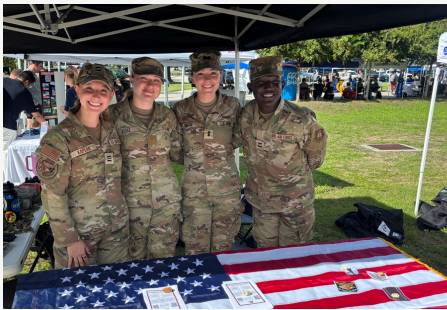
Our dedicated Cadets and Midshipmen volunteered their time at the activities fair, successfully recruiting new members and sharing our mission!