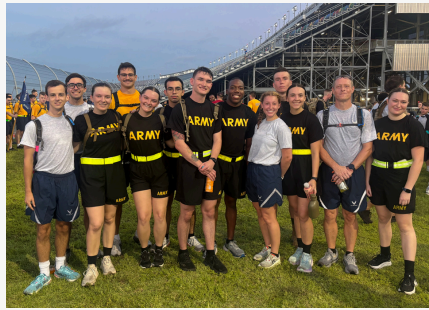
Members of Scabbard and Blade honored the heroes of 9/11 with a remembrance stair climb at Daytona's International Speedway.