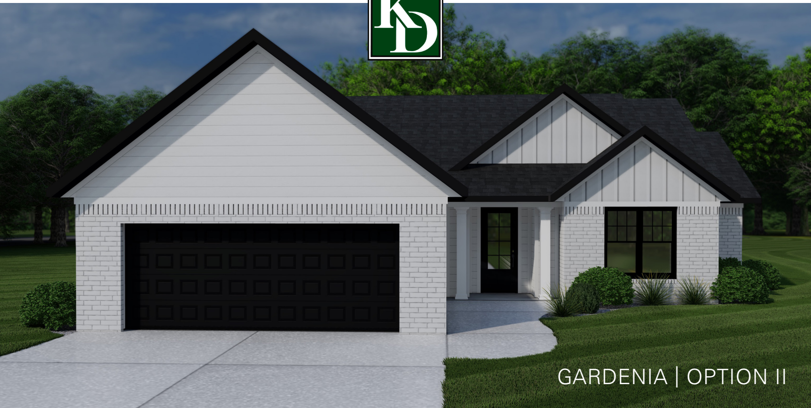
GARDENIA | OPTION II