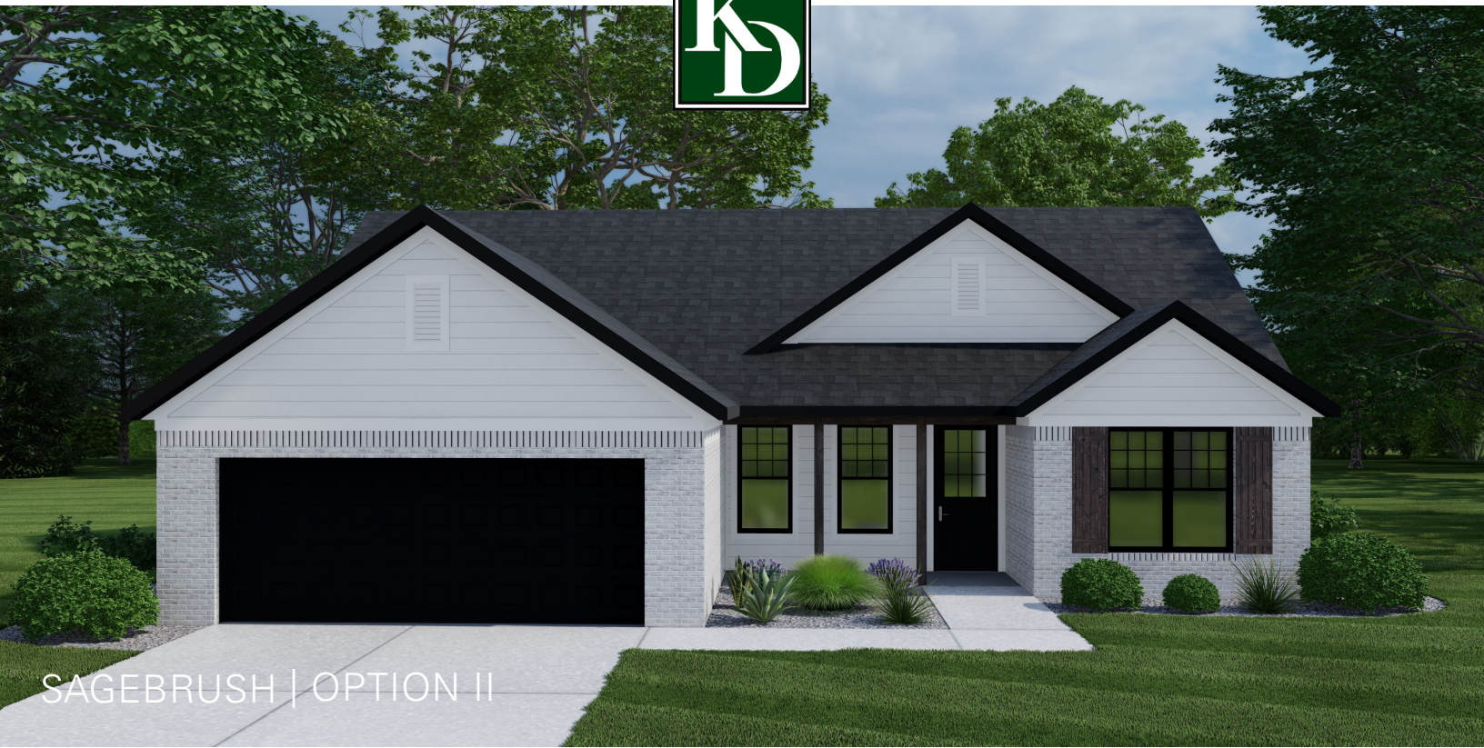
SAGEBRUSH | OPTION II