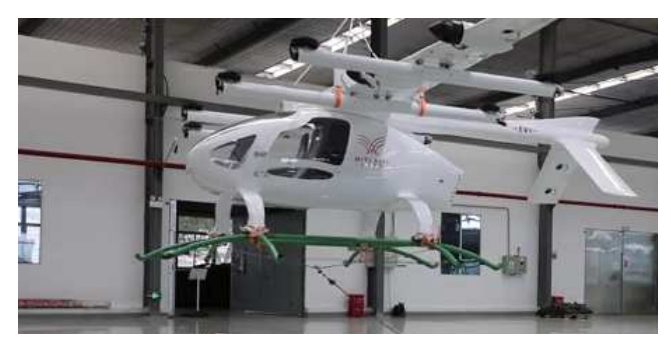
MuYu Aero eVTOL