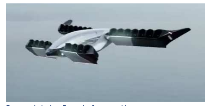
Pantuo Aviation Pantala Concept H