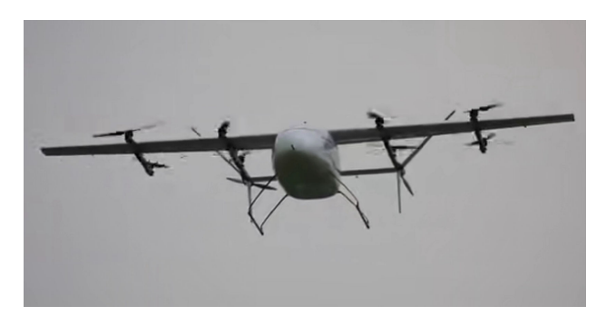
Volant Aerotech eVTOL