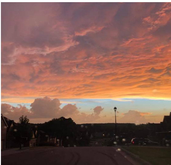
Beautiful picture off Salford Street