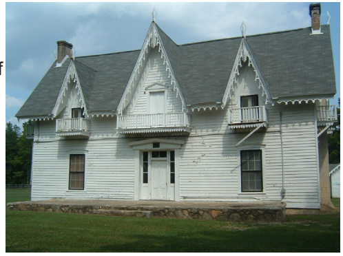
Spring Villa Mansion in Opelika, AL