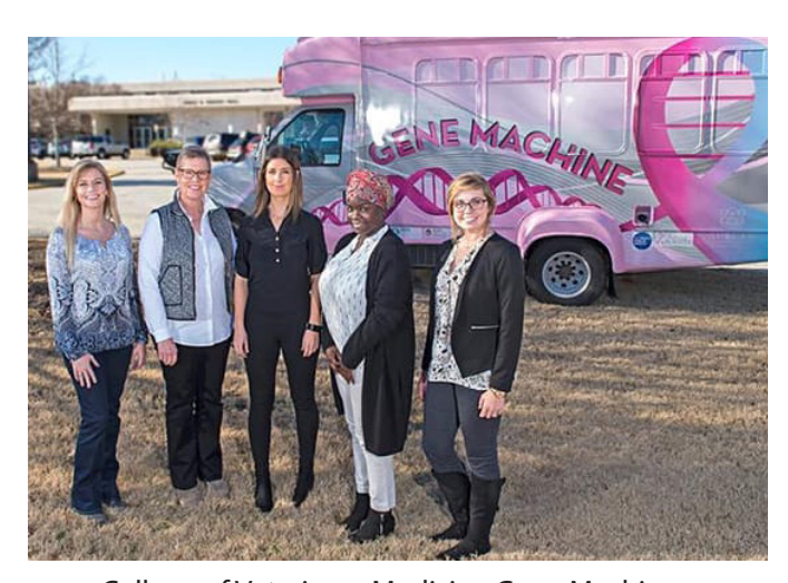
College of Veterinary Medicine Gene Machine

For more information, visit vetmed.auburn.edu/ academic-departments/dept-of-pathpathobiology/ research/the-gene-machine.