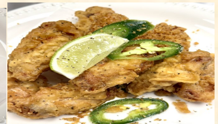
Salt and Pepper Classic Wing