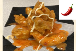
Spicy Crispy Shrimp