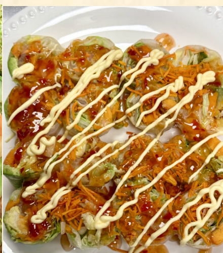
Fresh Wrap Yam Spring Roll