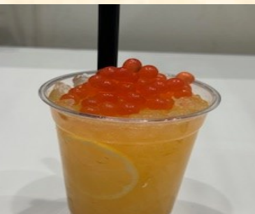
Lemonade w/ Popping Boba