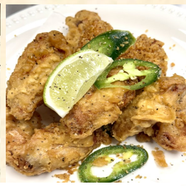
Salt & Pepper Classic Wing