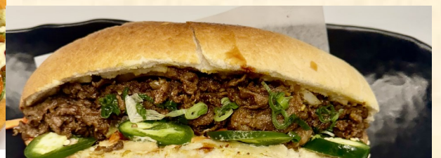
Banh Mi Sandwich Lemongrass Beef