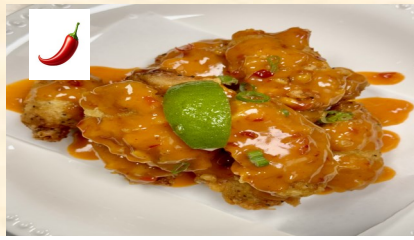
House Spicy Classic Wing