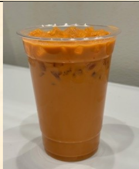
House Brew Thai Tea