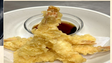
Crispy Shrimp Tempura

Deep Fried Cream Cheese w/ crab meat sushi Roll, serve w/ house spicy sauce