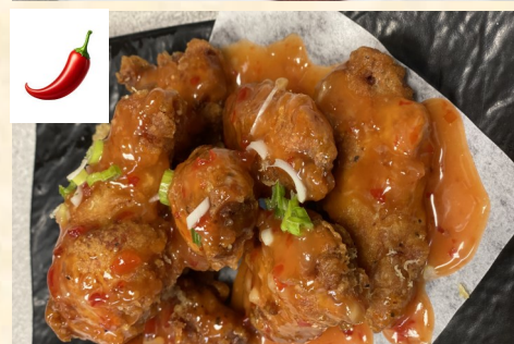
House Spicy Classic Wing