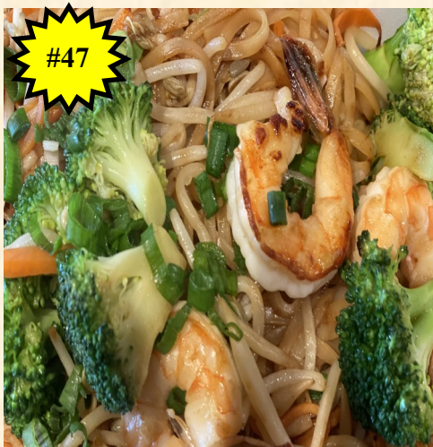
Stir Fried Rice Noodle with