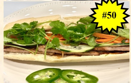
Banh Mi Charbroiled Pork