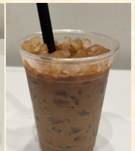
Vietnam Milk Coffee

Prices Do Not Include Tax | Prices May Change Without Notice. Please notify a server if you have any Allergies!