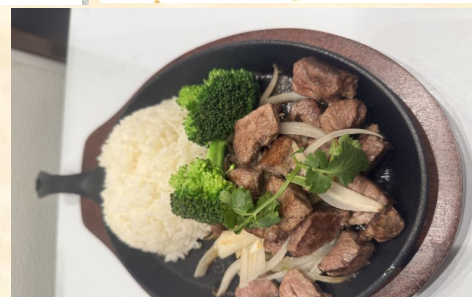
Shaken Beef Fillet Mignon