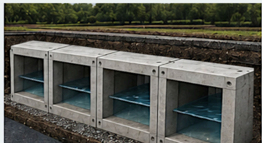
LONG-LASTING INFRASTRUCTURE. RELIABLE. SAFE. COST-EFFECTIVE.