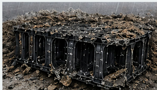
SHORT-TERM DECISIONS. LONG-TERM COSTS.