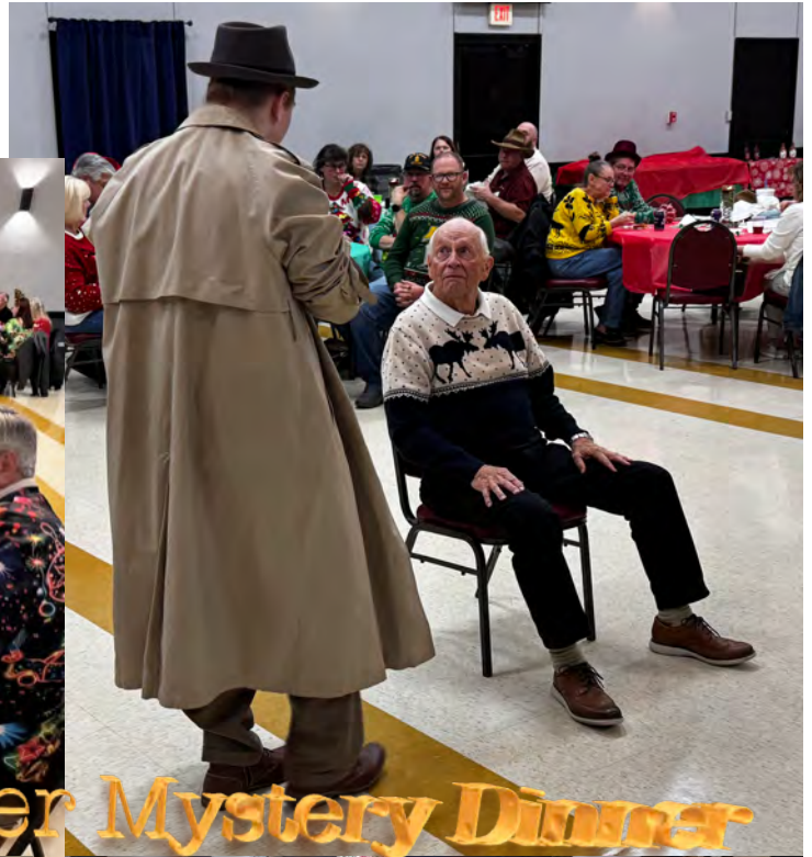
Blue Racers Murder Mystery Dinner