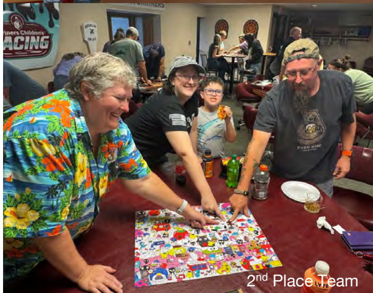
2 nd Place Team