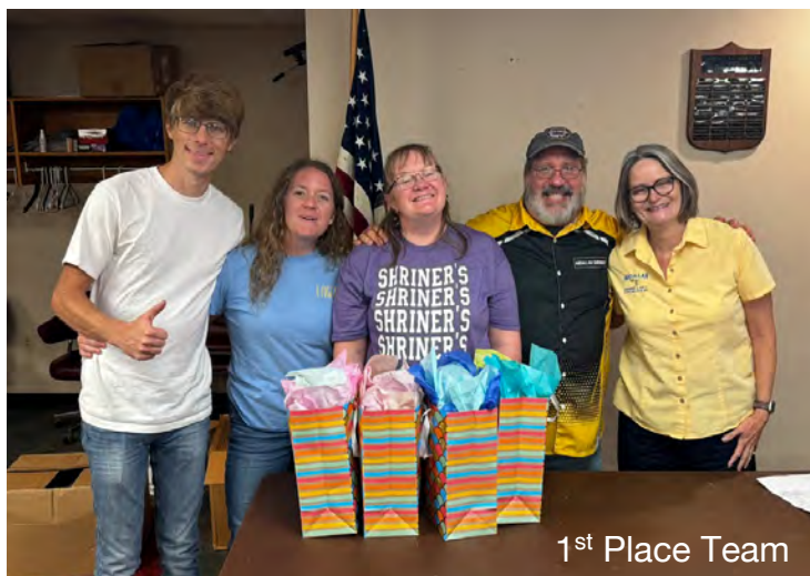
1 st Place Team