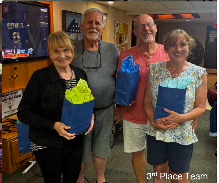
3 rd Place Team