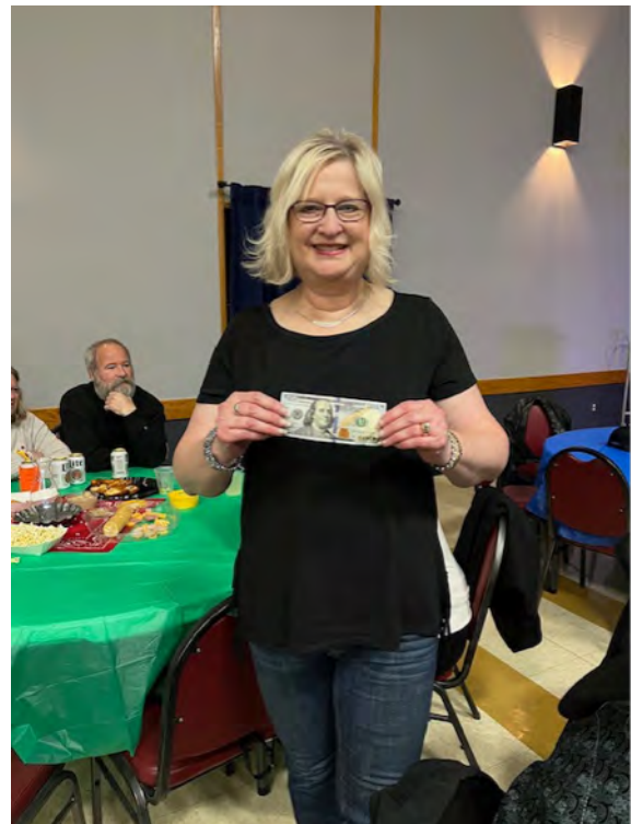
The winner of the Lizziettes $100.00 bill. Congratulations !