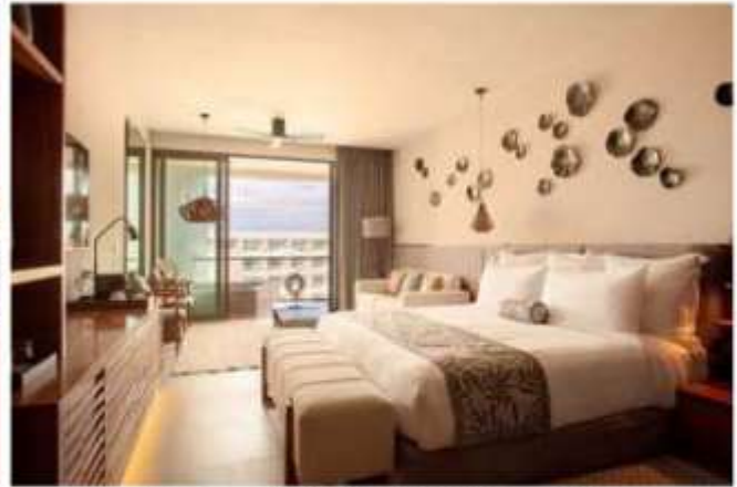
Preferred Club Jr. Suite Resort View