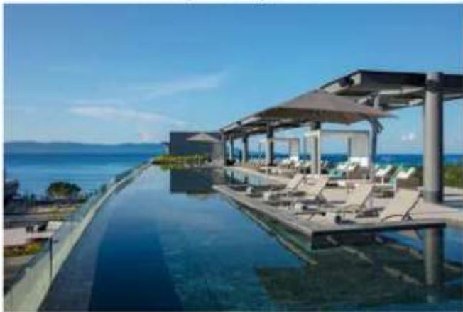
Infinity Water Deck