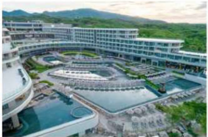
Secrets & Dreams Aerial View

Preferred CLUB Jr. Suite Resort View $4,940.00 for two Preferred CLUB Jr. Suite Ocean View $5,160.00 for two