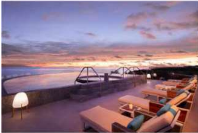
Rooftop Pool by Sunset