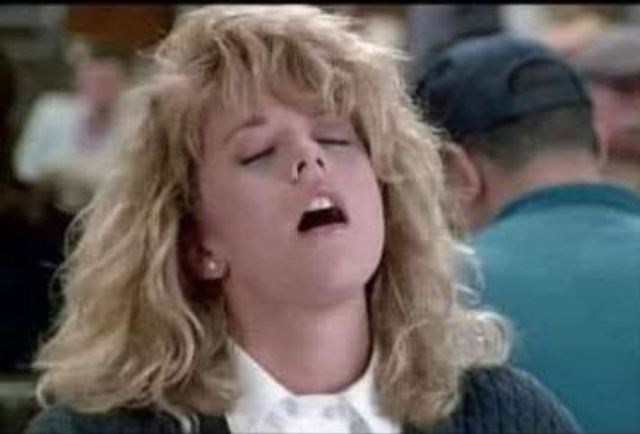
Airgasm: Intense pleasure from the air felt on the face when the mask is removed.

when you come out of the store and you have an airgasm