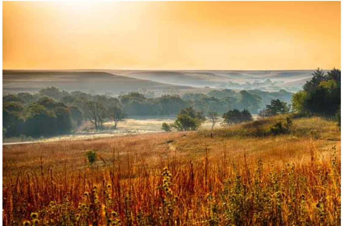
Autumn in the Kansas Flint Hills