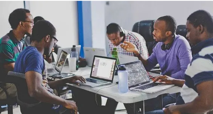
Production of Graphic Design Digital Marketing and Commerce