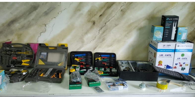
Computer Network Maintenance Repairs of Hospital and Biomedical Equipment