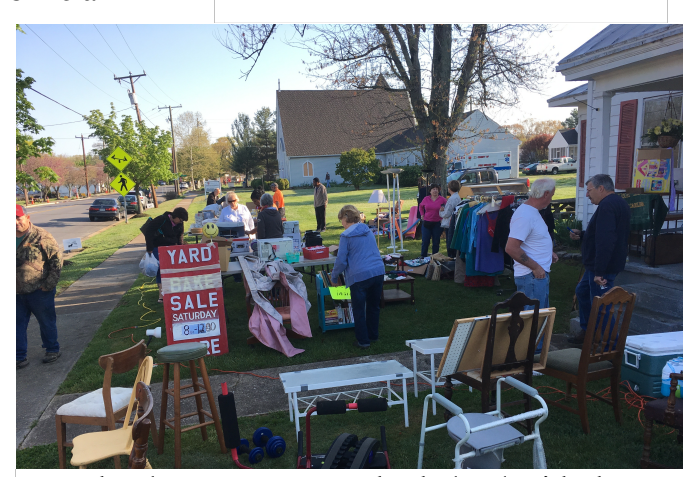
Thanks to everyone who helped with the May 28<sup>th</sup> Yard Sale Day