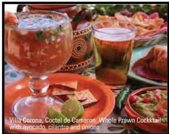
Villa Corona, Coctel de Camaron Whole Prawn Cocktail with avocado, cilantro and onions