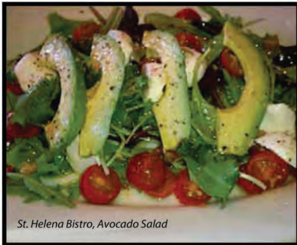
St. Helena Bistro, Avocado Salad

Please present coupon for redemption. Feel free to copy this page if you wish to use these coupons more than once.