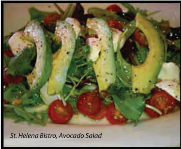
St. Helena Bistro, Avocado Salad

Please present coupon for redemption. Feel free to copy this page if you wish to use these coupons more than once.