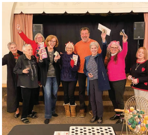
Valentine's Day Bingo winners