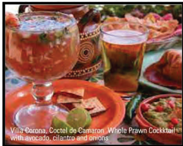
Villa Corona, Coctel de Camaron Whole Prawn Cockktail with avocado, cilantro and onions