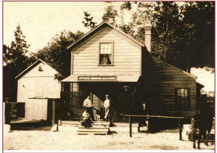
Stone Bridge Saloon, ca. 1910