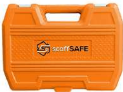
scaffSAFE Tool Kit BOX