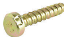
scaffSAFE Anchor Bolt 12mm x 75mm Electroplated