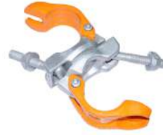
scaffSAFE Swivel Coupler - Galvanised