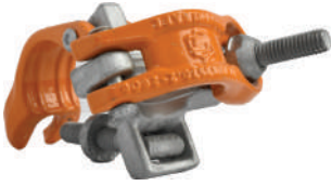
scaffSAFE Double Coupler - Galvanised