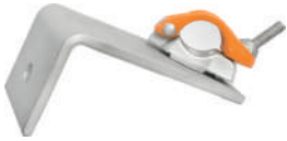
scaffSAFE Wall Tie Bracket One Coupler Galvanised