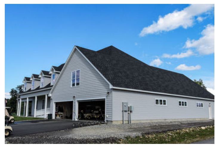
Granite Fields 7-1178