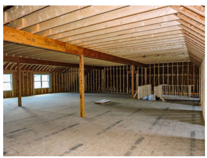
Granite Fields 1-1163