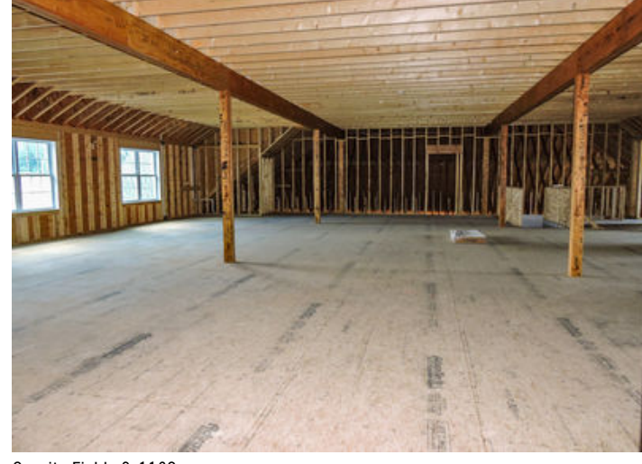
Granite Fields 3-1168