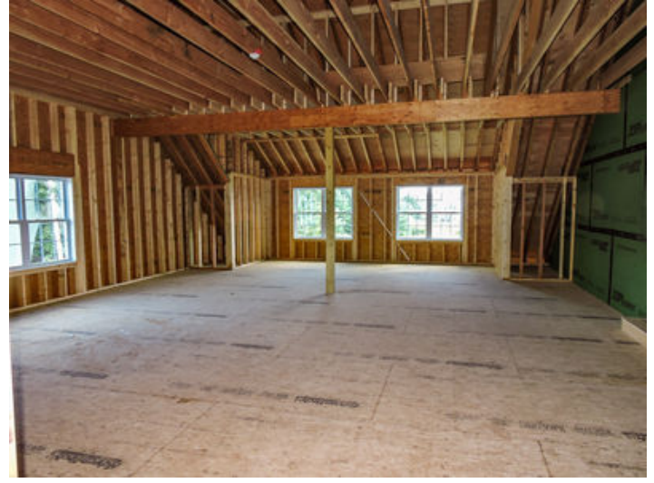
Granite Fields 2-1167