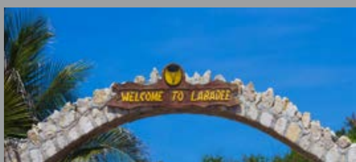
Labadee, Haiti, has welcomed Royal Caribbean guests since the late 1980s.

Read the full article online to learn more.