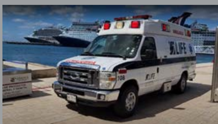
An ambulance transports a passenger from our cruise ship.