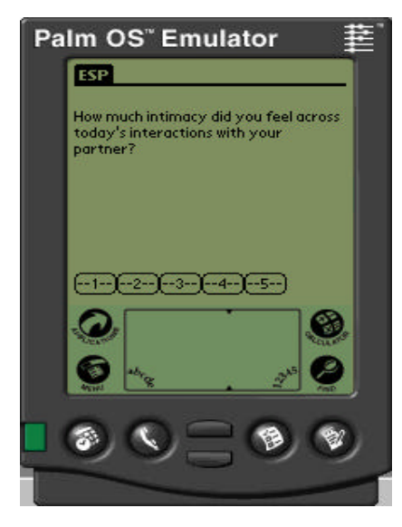
Figure 1: Illustration of a question presented on a Palm Pilot<sup>™</sup> IIIx by the ESP software

the PDA at a specified time to initiate a trial, and items can be randomized if desired.