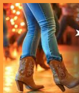
Country Line 7/31 & 8/28