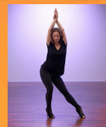
Heels Jazz 7/17 & 8/14