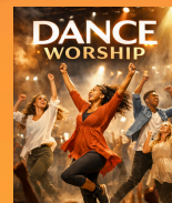
Praise & Worship 7/13 & 8/10