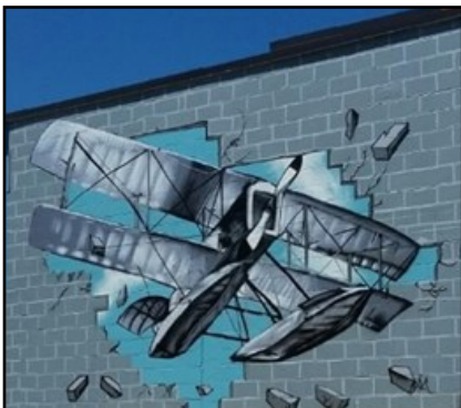
A tribute to Boeing at the Four Generals, Wells Avenue S.