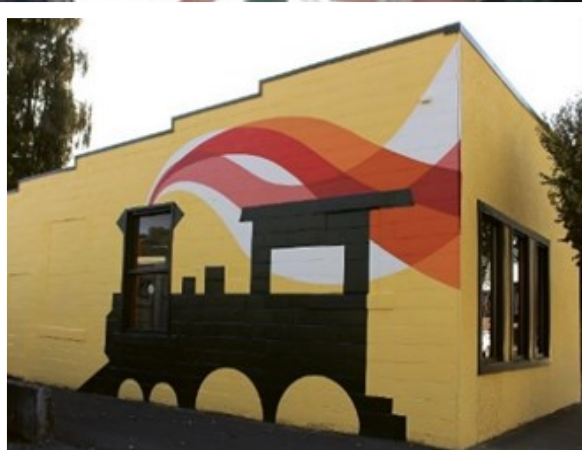
Remembering the railroad at the Whistle Stop on Williams Avenue S