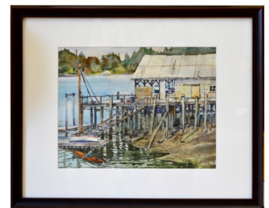
Doug Keyes Memorial Award "Harbor Kayaking"