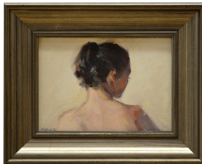
Nancy Hoben Memorial Award "Resilience"