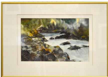
Susan Ringwood Memorial Award "Woodland Stream"