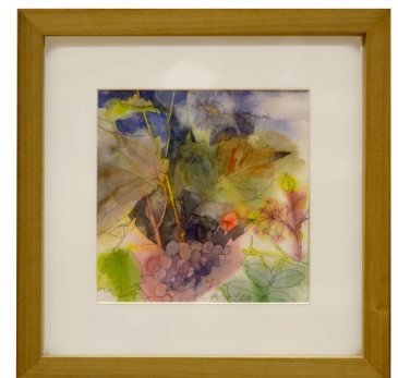
Allied Arts Award "P-Patch II"