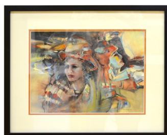
Andee Jorgensen Memorial Award "Sisters"