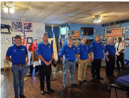
Installation of Officers for Sons of the American Legion Squadron 173 Holiday, FL.