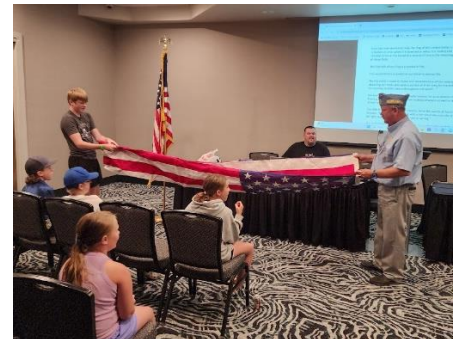
The Detachment of Nebraska holds a flag education program at their Children and Youth Academy at their Detachment Convention on 8 July.