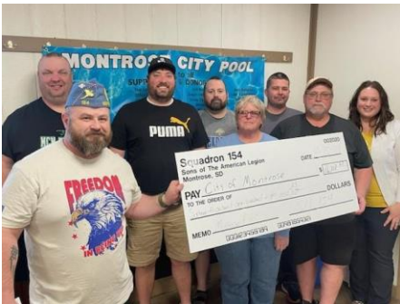
At their regular monthly meeting, Squadron 154 Montrose, SD presented to the city of Montrose a check for $16,108.23.