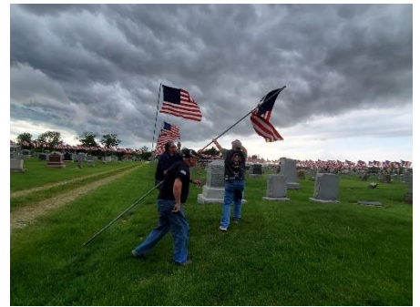
Sons of the American Legion Squadron 202 Columbia, MO assisted the city of Centralia with the lowering of the American flags at Glendale Memorial Gardens Cemetery. High winds made it difficult, but did not deter the members of SAL 202 and other volunteers who worked diligently and respectfully trying to beat the rain.