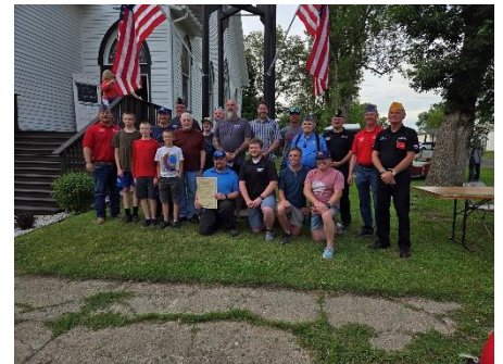
Egan, SD Post 97 held a dedication to their avenue of flags in July, and on the same day, received their new charter for Squadron 97.