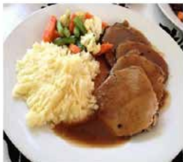
Roast Beef Mashed Potatoes and Green Beans