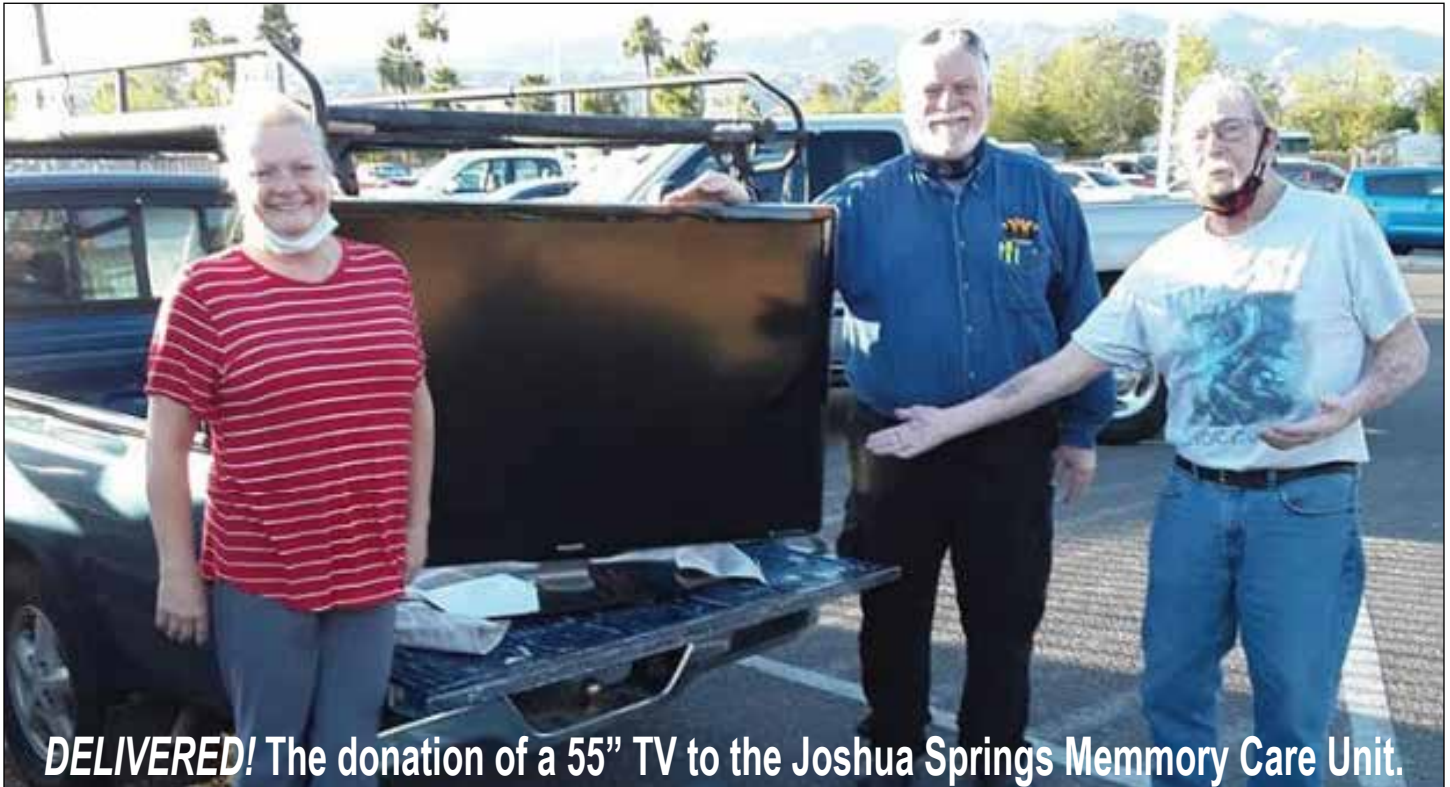
DELIVERED! The donation of a 55" TV to the Joshua Springs Memmory Care Unit.

2. All Dinos want to do is have fun! It is amazing how coordinated and vocal they are! Click here to see and hear one sing! Dinosaurs can sing and cut a rug!