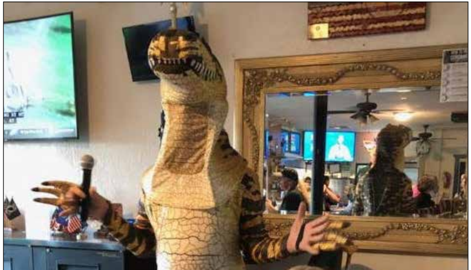
Singing out to raise funds and have fun! Membership Drive: Looking for Future Senior Dino Squad Members and D.I.T.'s (Dinosaurs In Training – those with less than 70 revolutions around the sun)

4. Remember the fundraiser from above where patrons donated and received their personal dinosaur. Well, now they are all over the post, to remind ALL who enter that Dinosaurs that inhabit our Post.