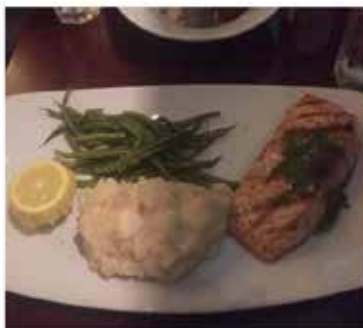
Salmon Mashed Potatoes and Green Beans