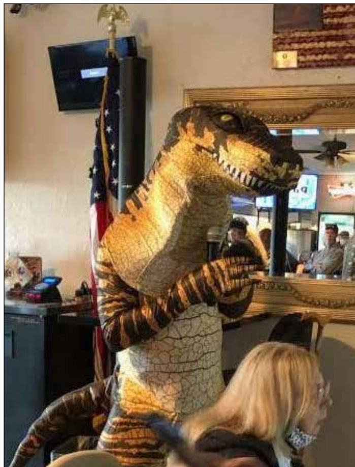
How often do you see this at your Post?

Those funds are going to be used to purchase items for the residents that are not supplied to them. The toy dino fundraiser will be continuing.