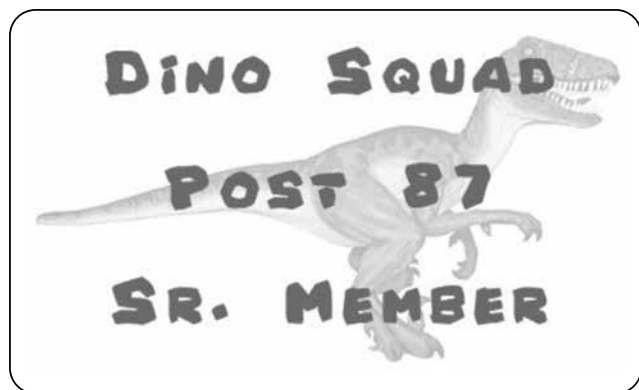
The Senior Dinosaur Membership Card

You must have attained at least seventy revolutions around the sun to be a senior Member and receive your membership status and card.