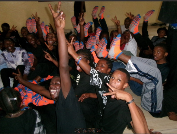
The Lord is Good to All...- Psalm 145:9