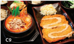
C9 黃金炸豬排+嫩豆腐 Pork Cutlet + Tofu Soup 돈가스 + 순두부 Lunch 24.99 Dinner 26.99