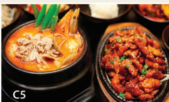
C5 辣烤雞肉+嫩豆腐 Spicy Grilled Chicken + Tofu Soup 매운닭불고기 + 순두부 Lunch 26.99 Dinner 29.99