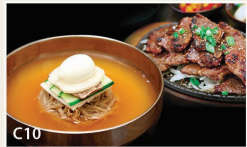
C10 烤牛排骨+冷麵 Galbi (BBQ Beef Rib) + Naeng Myun 갈비 + 냉면 Lunch 33.99 Dinner 35.99