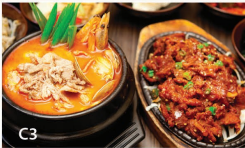
C3 辣烤猪肉+嫩豆腐 Spicy Pork + Tofu Soup 돼지불고기 + 순두부 Lunch 26.99 Dinner 29.99