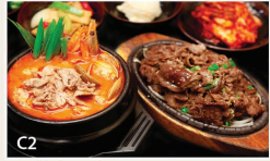
C2 烤牛肉+嫩豆腐 Bulgogi + Tofu Soup (BBQ Marinated Beef) 불고기 + 순두부 Lunch 27.99 Dinner 30.99