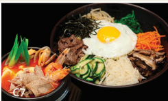
C7 什錦拌飯+嫩豆腐 Bibimbap + Tofu Soup (Rice w/ Assorted Vegetables & Beef) 비빔밥 + 순두부 Lunch 25.99 Dinner 28.99