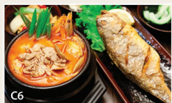
C6 炸黃魚+嫩豆腐 Fried Yellow Croaker + Tofu Soup 조기구이 + 순두부 Lunch 25.99 Dinner 27.99