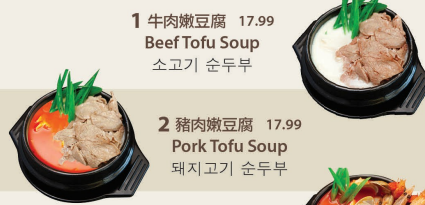
1 牛肉嫩豆腐 17.99 Beef Tofu Soup 소고기 순두부