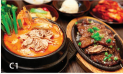
C1 烤牛排骨+嫩豆腐 Galbi (BBQ Beef Rib) (6pcs) + Tofu Soup 갈비 + 순두부 Lunch 33.99 Dinner 35.99

午餐(Lunch) 11:00am-3:00pm 週一至週五(Mon-Fri) 假日除外(EXCEPT HOLIDAYS)