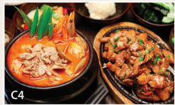
C4 烤雞肉+嫩豆腐 Grilled Teriyaki Chicken + Tofu Soup 테리야끼치킨 + 순두부 Lunch 26.99 Dinner 29.99