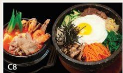
C8 石鍋拌飯+嫩豆腐 Dolsot Bibimbap + Tofu Soup (Rice w/ Assorted Vegetables & Beef in Hot Stone Pot) 돌솥비빔밥 + 순두부 Lunch 26.99 Dinner 29.99