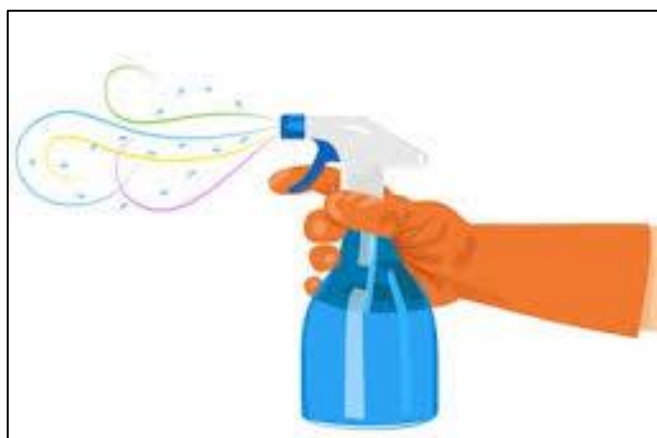
Frequent Sanitizing and Daily Deep Cleaning