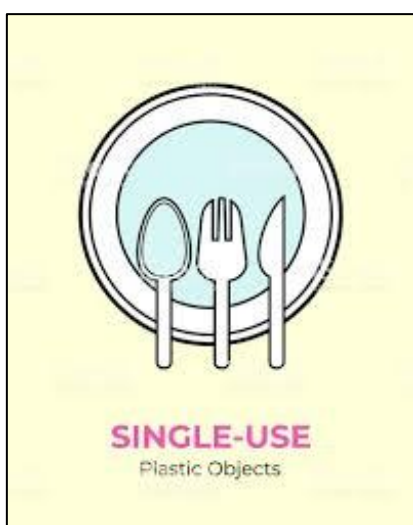
Single Use Utensils Available upon Request