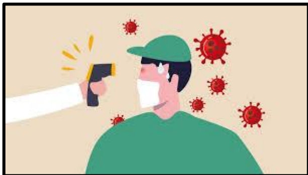
Temperatures Check All Employees