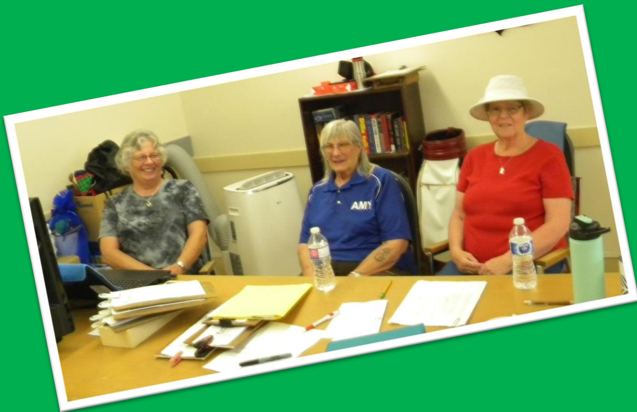
The awesome ladies that kept track of all the paperwork