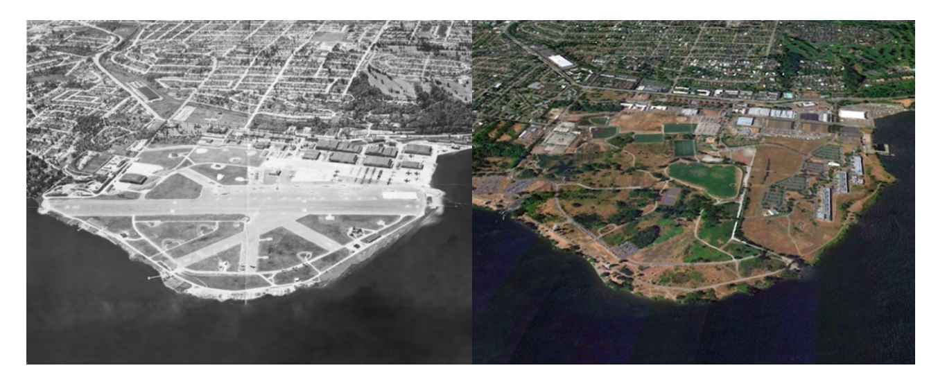
1953. Naval Air Base. 2011. Restoration in progress.

The large restoration project to create wetlands and improve water quality in the park area was completed in 2013. These treatment wetlands act as a filter, slowing down water from uphill housing areas and removing pollutants before the water flows out into Lake Washington. Beavers moving in and renovating the area have only made the wetlands bigger and better, emphasizing the important role they play in creating habitat and maintaining water quality!