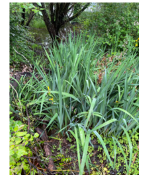
Yellow Flag Iris