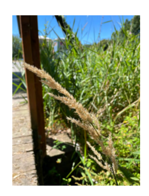
Reed Canary Grass