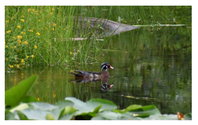
Wood duck.

Cast your gaze upon the first pond you have encountered on this walk. On a warm, sunny day, you may see wood ducks and ducklings swimming across the pond as well as butterflies fluttering about. Note the willows around you growing as shrubs rather than trees. As a beaver-resistant plant, established willows are able to resprout even when chewed down to a stump.