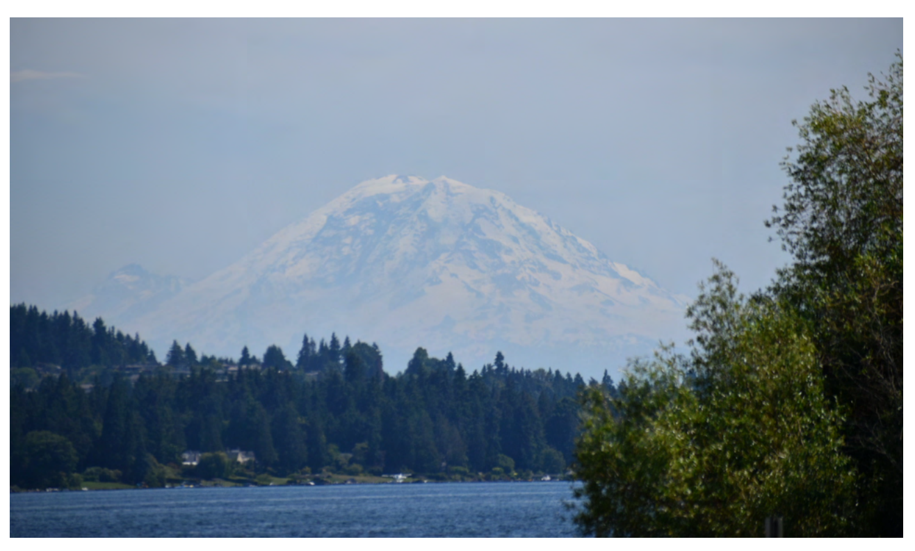
Mount Rainier as seen from Magnuson Park.

INTERESTED IN GOING ON A NATURE WALK BUT DON'T KNOW WHERE TO START? THIS IS THE GUIDE FOR YOU!