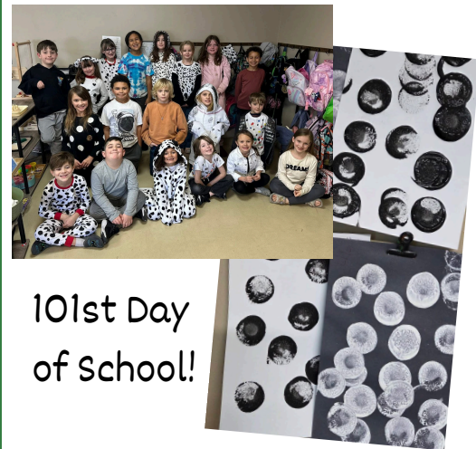
101st Day of School!

Scroll to pages 6 & 7 for Valentine's Day information!