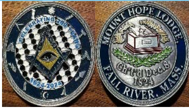
Mount Hope Lodge "Spinner coin" 200 th Anniversary

Contact Wor Pimentel 508-245-4068 or bro.adam.pimentel@gmail.com