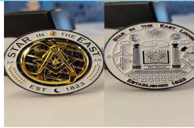
NEW Star in the East coin