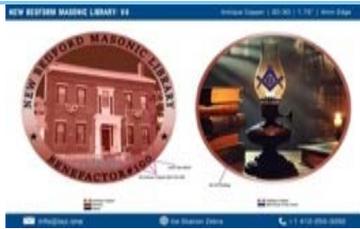
New Bedford Library Benefactor Coin