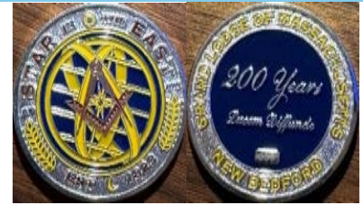
Star in The East 200 th Anniversary Coin