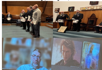
Lodge of Instruction January 23 rd , 2025 Thursday January 23 rd , 2025