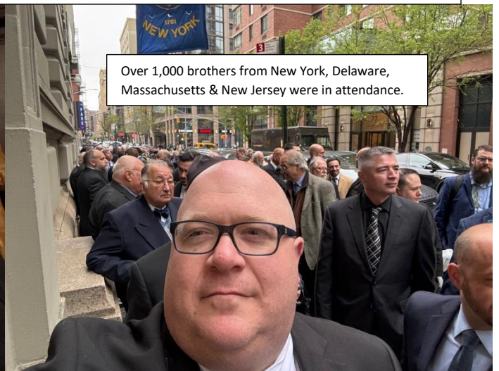
Over 1,000 brothers from New York, Delaware, Massachusetts & New Jersey were in attendance.