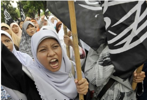
shouting hatred of Christian Indonesians

Has the largest population of all Muslim countries. About 86% of the 238 million people are Muslim. Massive discrimination and violence, including extreme violence (beheadings) is waged against the minority Christians,