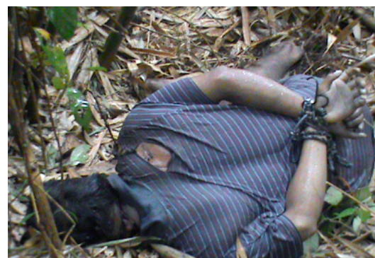
A Burmese Buddhist rubberworker tortured and killed by Malay Muslims.

The status of religious freedom in Malaysia is a controversial issue. Islam is the official state religion even though nearly half of the population (mostly Chinese and Indians, along with Thais, Burmese and Indonesians) are not Muslim. There are many Burmese who spent time in Malaysian refugee camps and describe the very bigoted, cruel and intolerant treatment at the hands of the Malay Muslims. Malaysia also has a policy called ' Bumiputra ' which requires that all businesses must have a Malay Muslim partner. Even a Chinese magazine or incense maker, or an Indian food maker or bookstore would have to accept the unneeded and often contemptuous and supremacist Muslim partner – who typically knows nothing about the business. Malaysia is also known to ' convert ' a non-Muslim to Islam upon their death, by relabeling the person as a Muslim on the death certificate – causing the children of that person to be declared Muslims – and the dangers of trying to convert from Islam are well known and feared.