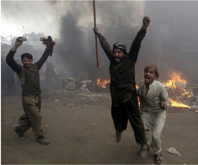
Muslims in Pakistan jump for joy as they burn Christian homes and churches. Buddhists and Hindus in Bangladesh were suffering the same fate at about the same time last week.