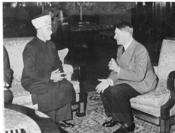
The Grand Mufti (Islamic leader) of Jerusalem with Hitler. They met often, helped each other, and planned death and destruction.