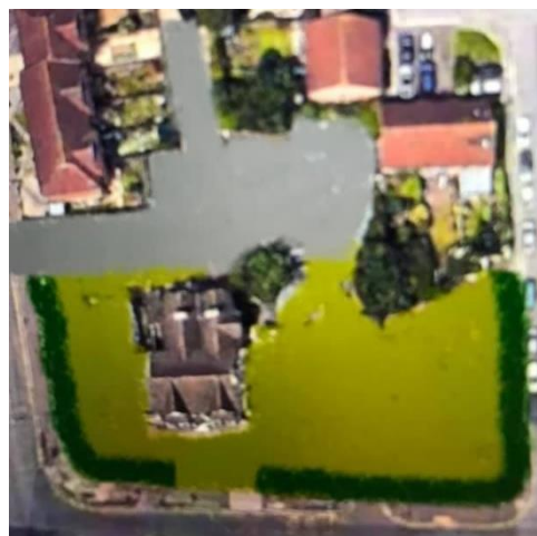
Hillsboro House is located on the corner of Southchurch Road and Bournemouth Park Road.