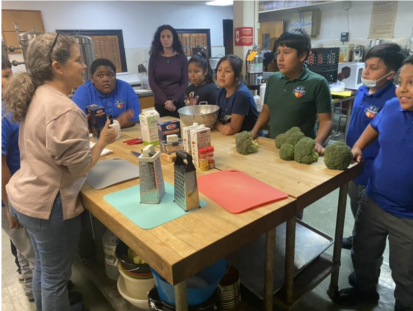
Cooking From The Garden Program