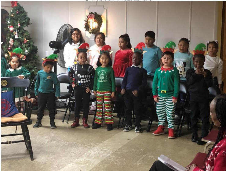
After School Production of The Elves and The Shoemaker