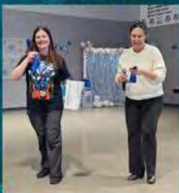
Ms. Quick Best Lost & Found Finder