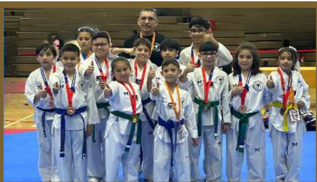
5 Taekwondo Titans shine at the Arizona State Championships