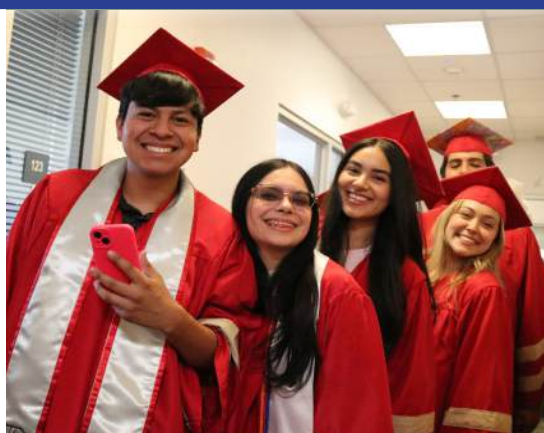
12 A Colorful Display of Unity: Seniors Shine in the Annual C2G Parade