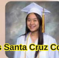
8 2025 Graduations Across Santa Cruz County