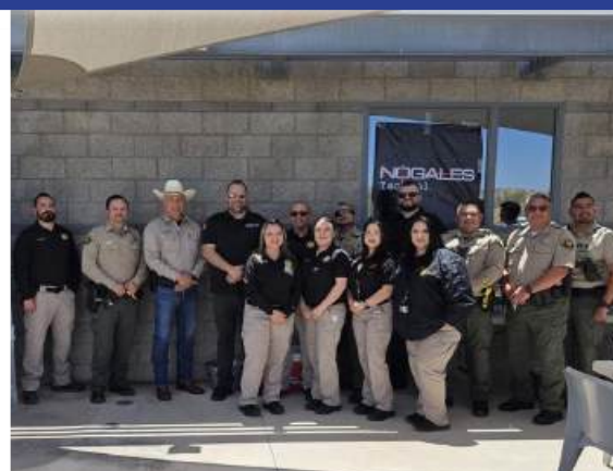
15 Sheriff's June Round-Up