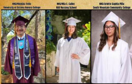
University of Arizona Honors College