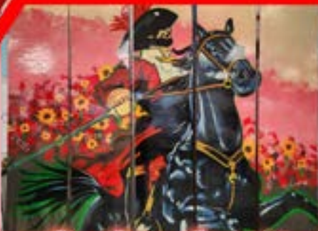
Rio Rico Insights