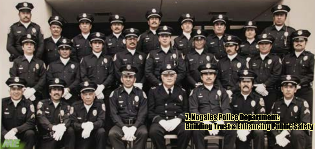
7. Nogales Police Department: Building Trust & Enhancing Public Safety Together

City Hall/Police Department opened circa 1979