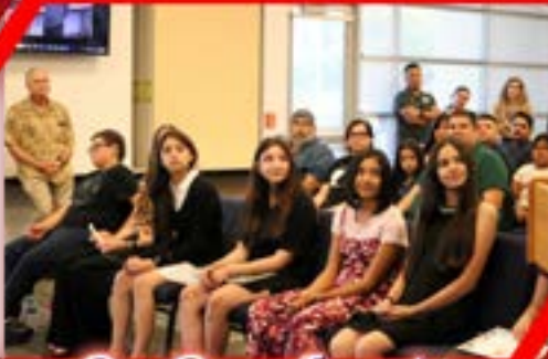
Rio Rico Insights

As the students walked away with their well-deserved recognition, it was clear that this experience would stay with them for a lifetime. Their achievement is a shining example of what can be accomplished when talent and dedication come together. We can't wait to see what the future holds for these talented young Cavaliers.