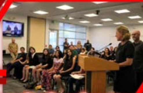
Rio Rico Insights