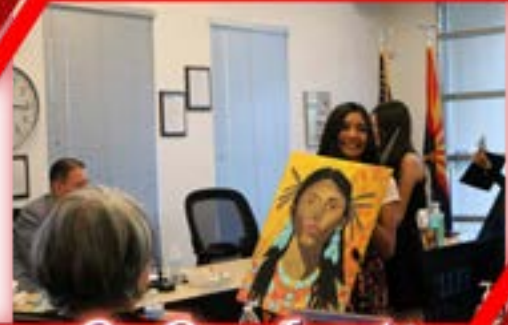
Rio Rico Insights