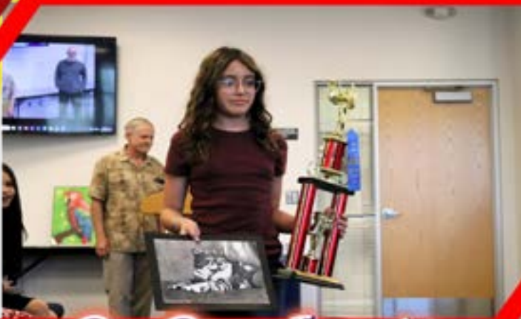
Rio Rico Insights

School Awards: Mountain View Elementary School's achievements mirror those of other notable schools, such as Birch Tree Elementary School and Willow Springs Elementary School, which have also earned awards for their artistic endeavors.