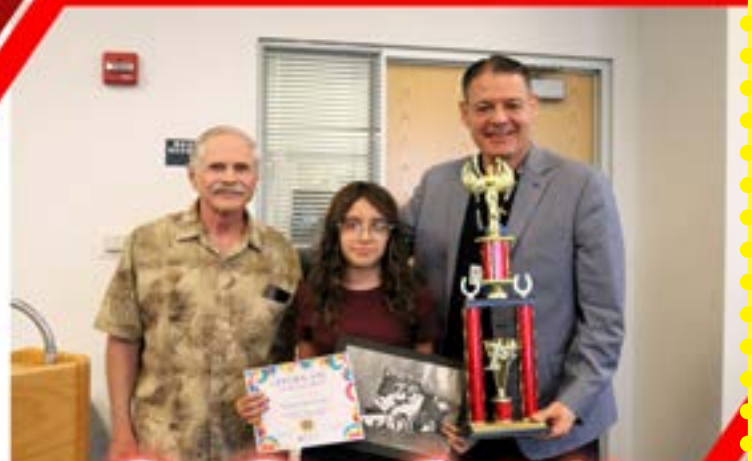
Rio Rico Insights