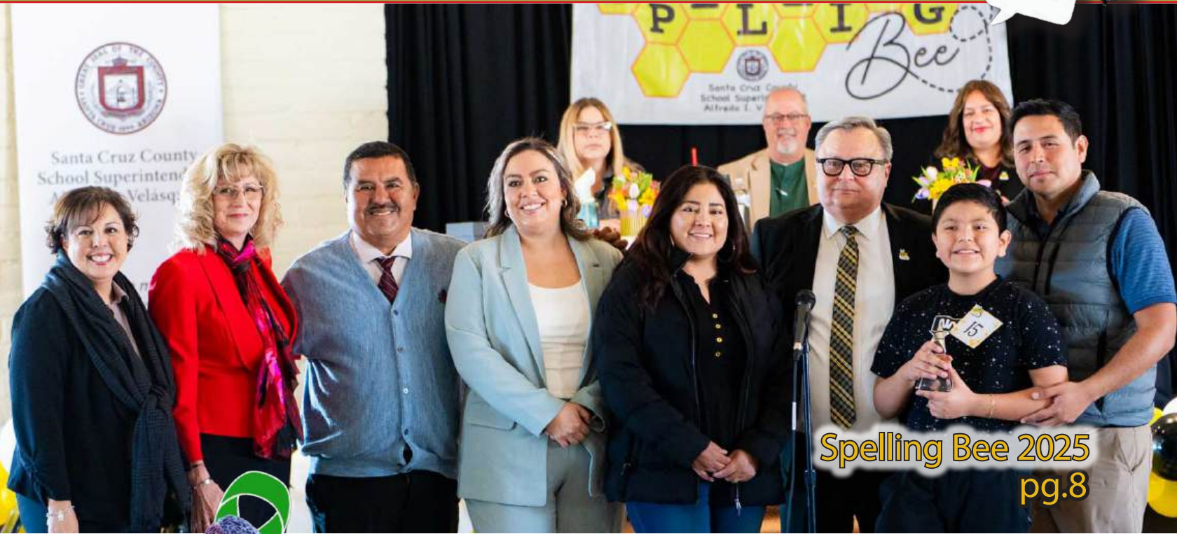
Spelling Bee 2025 pg.8