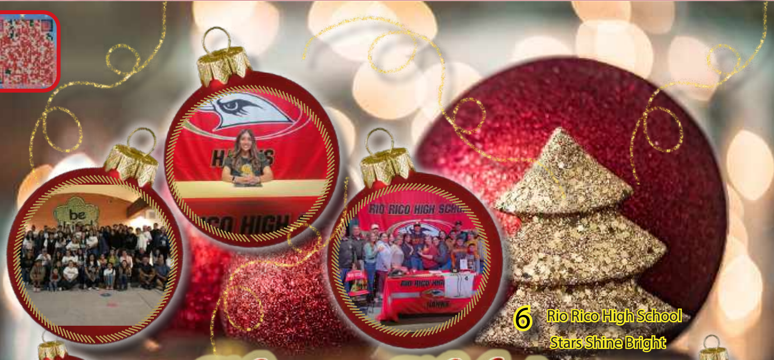
6 Rio Rico High School Stars Shine Bright