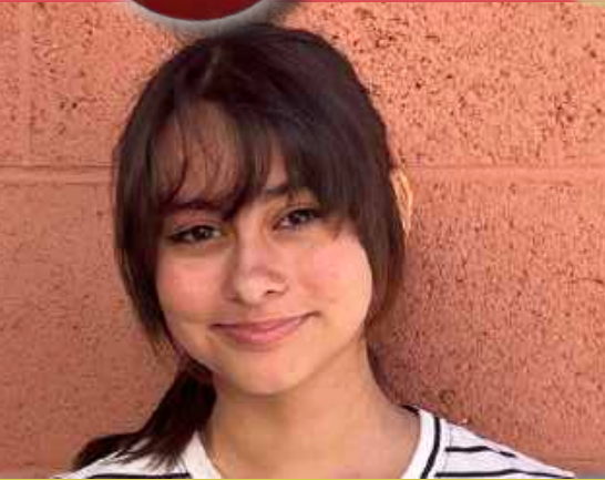
7 Embarking on Greatness