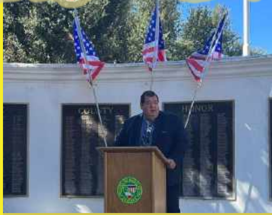
13 Mayor's Corner-December